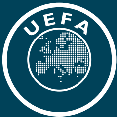
Aleksander Čeferin UEFA President

More than ever before, sports organisations need leaders and decision-makers who understand the global challenges influencing the future of sport and who are quick to take decisions within an ethical framework.