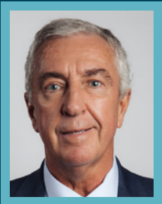
Luc Tardif IIHF President